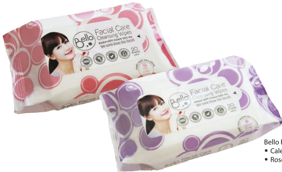
Bello Facial Care Cleansing Wipes 20s • Calendula Flower Extract (BE3970) • Rose Water Extract (BE3969)

Formulated according to a targeted line of natural essence and blended into gentle cleansing lotion for more effective facial cleansing, these wipes effectively cleanse and remove make-up and tone all skin types. With the targeted line of natural extracts, this mild formulation that contains Aloe Vera, Vitamin E and extra emollient is suitable for all skin types, especially normal to dry skin. Alcohol-free and pH 5.5.