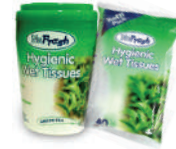
NF3888 Hygienic Wet Tissues Value Pack Green Tea (Cup + Refill)