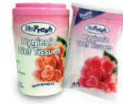
NF3887 Hygienic Wet Tissues Value Pack Rose Bouquet (Cup + Refill)

Private Label and Contract Manufacturing are also available.