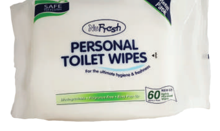
NF3848 NuFresh Personal Toilet Wipes 2 x 10s