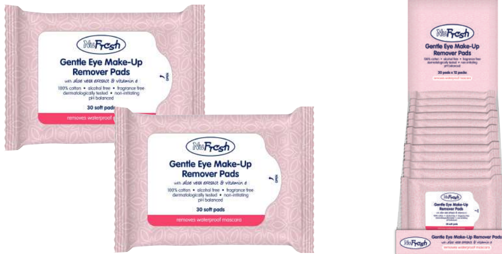
NF3909 NuFresh Eye Makeup Remover Pads 30s