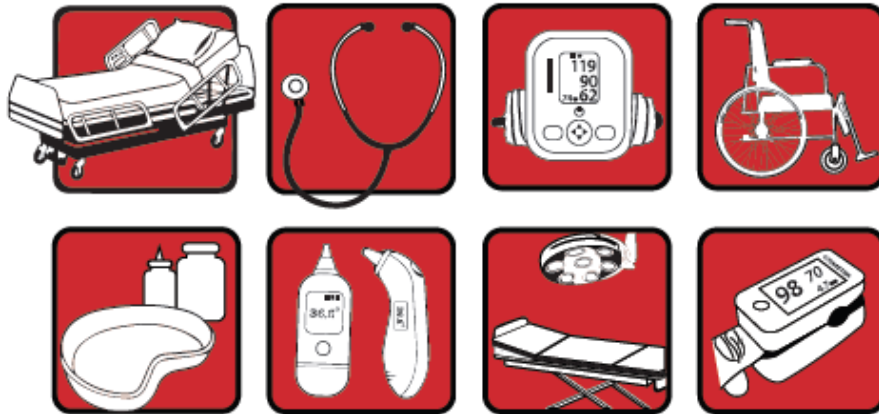
Figure 2: Types of non-invasive medical devices that are suitable for wet wipes

The wipes can be used on general non-invasive medical devices as depicted in Figure 2, such as hospital beds, wheelchairs and thermometers.