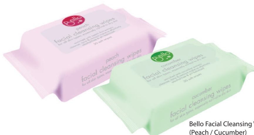
Bello Facial Cleansing Wipes (Peach / Cucumber)

Formulated according to a targeted line of natural essence and blended into gentle cleansing lotion for more effective facial cleansing, these wipes effectively cleanse and remove make-up and tone all skin types. With the targeted line of natural extracts, this mild formulation that contains Aloe Vera, Vitamin E and extra emollient is suitable for all skin types, especially normal to dry skin. Alcohol-free and balanced pH.