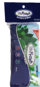
NF3830 NuFresh Anti-Bacterial Wipes 1s x 10