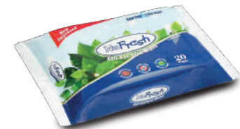
NF3801 NuFresh Anti-Bacterial Wipes 20s