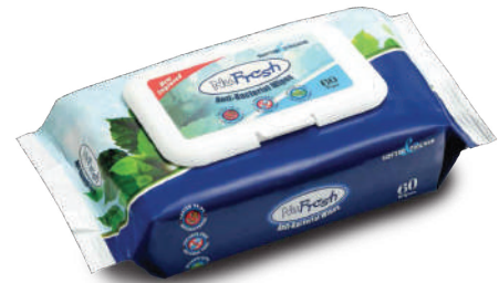
NF3831 NuFresh Anti-Bacterial Wipes 60s

Private Label and Contract Manufacturing are also available.