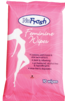
NF3823 NuFresh Feminine Wipes 10s